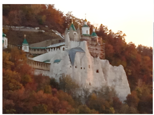
This is the oldest part of the Monastery.