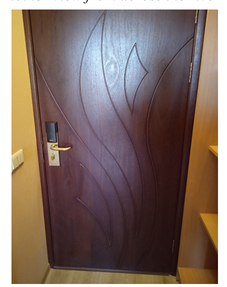
Isn't often you find a door you want a picture of.